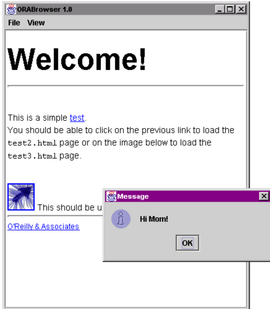
Figure 1-3. The new ORABrowser with big <H1> tags and minimal “ORAScript” support