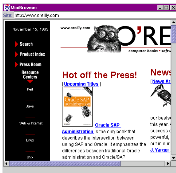
Figure 1-1. MiniBrowser1 on a Mac OS X system displaying www.oreilly.com

where most of the real work in this example occurs.* If all you want to do is display HTML text in your application, this is the example to look at.