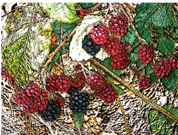
Figure 3: One of the more popular uses for the Lighting Effects filter is to create textures. Here's a rather exaggerated use of the Texture Channel to create a highly textured effect. Usually, you'd use this in conjunction with other filters for artistic treatments of your photos.

The final area is Texture Channel. You can use the Lighting Effects filter to add texture to your image by creating a relief effect, as shown in Figure 3.