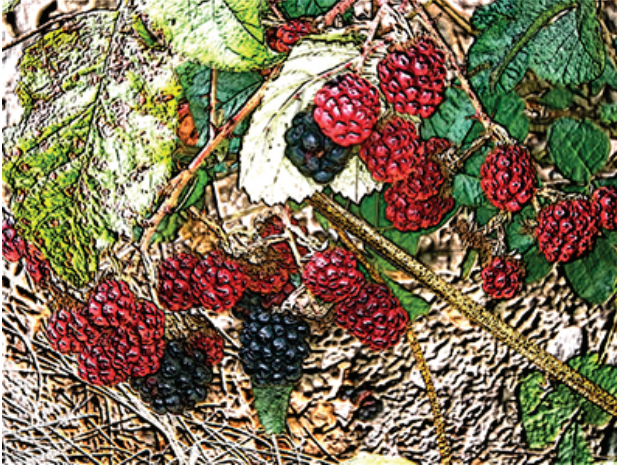
Figure 3: One of the more popular uses for the Lighting Effects filter is to create textures. Here's a rather exaggerated use of the Texture Channel to create a highly textured effect. Usually, you'd use this in conjunction with other filters for artistic treatments of your photos.

You may need a bit of practice to get really comfortable with the Lighting Effects filter. Once you understand how the controls work, you can create very sophisticated lighting effects with it. You may also find that your increased understanding of lighting helps you with lighting your photographs as you take them.